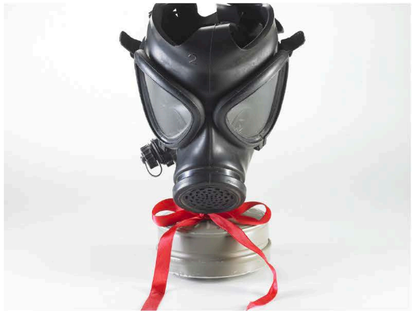
Shadi Ghadirian, White Square , 2009